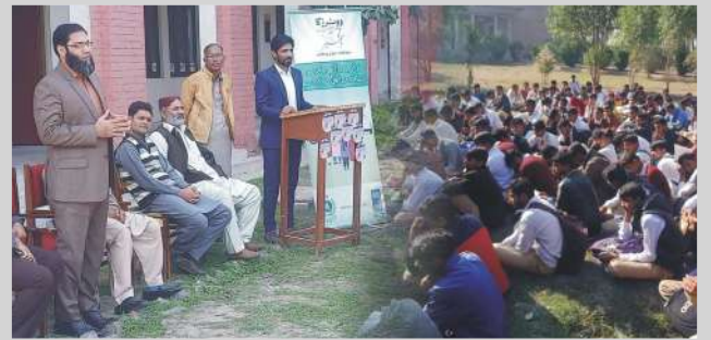
Student Voter Awareness Session in Shaikhupura