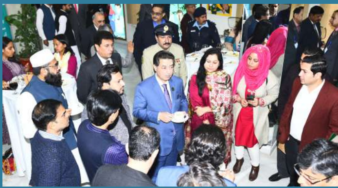
Hon'ble Chief Election Commissioner Mr. Sikandar Sultan Raja interacting with media persons on National Voters' Day 7 th December, 2022 at ECP Secretariat, Islamabad.