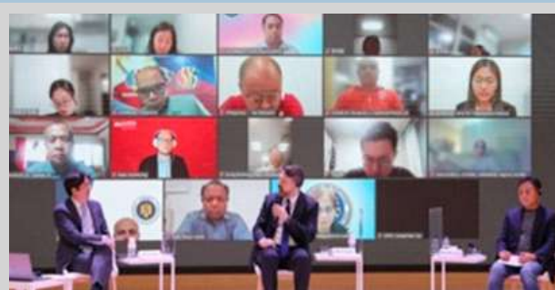
The NEC of the Republic of Korea holds 2022 Seoul International Forum on Elections (SIFE) on 10 th November, 2022 (Online)

National Election Commission (NEC) of the Republic of Korea invited Election Commission of Pakistan to participate in (online) 7 th Anniversary of Seoul International Forum on Election, where the theme was “Democracy, Responding to the Changing Environment” on 10 th November, 2022. Over 150