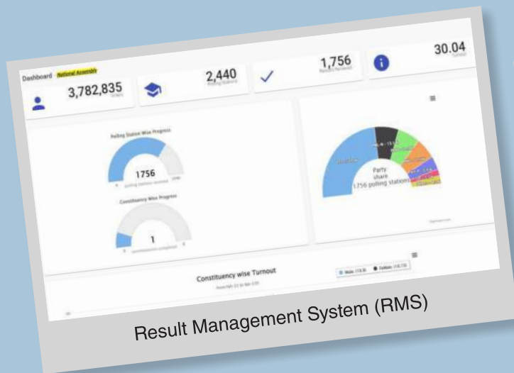
Result Management System (RMS)