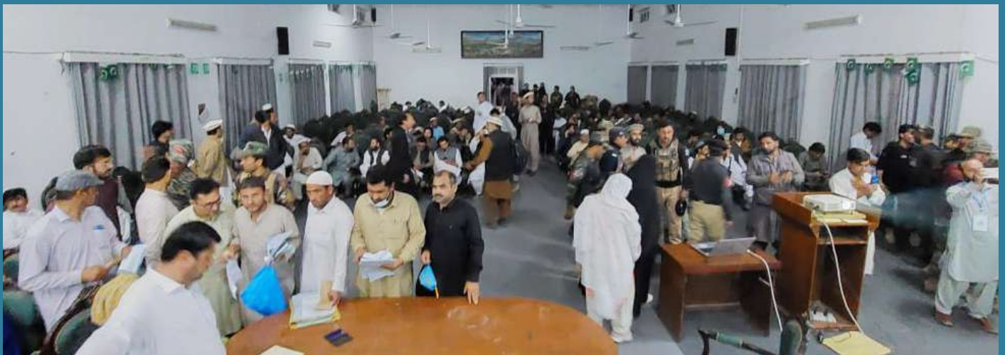
ECP showing live results to candidates, agents and media at NA 45 Kurram Bye-Election through Result Management System (RMS)