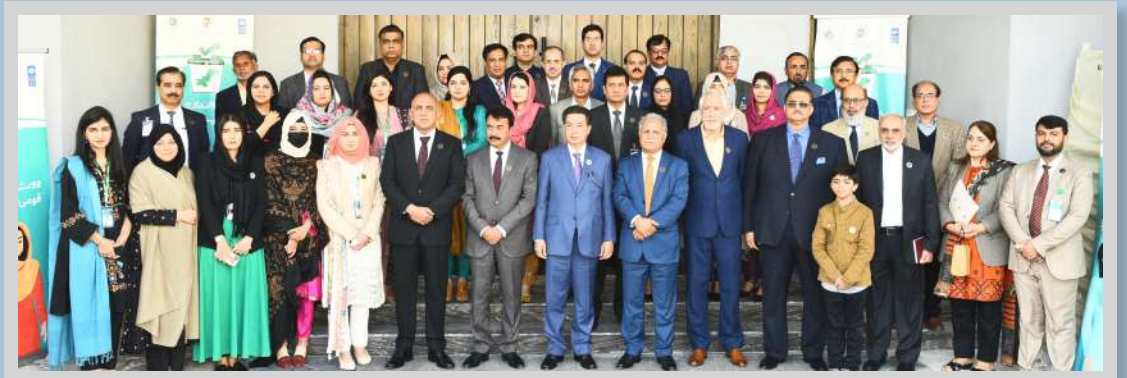
Group Photo of the Commission with officers of ECP on National Voters' Day 7 th December, 2022 at ECP Secretariat, Islamabad.