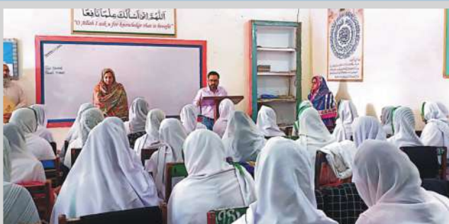
Student Voter Awareness Session in Rahim Yar Khan