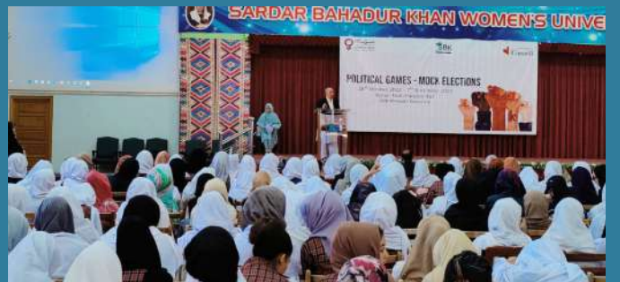
Student Voter Awareness Session in Quetta