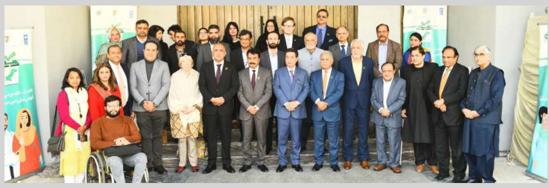
Group Photo of the Commission with representatives of international community and NGOs on National Voters' Day 7 th December, 2022 at ECP Secretariat, Islamabad.