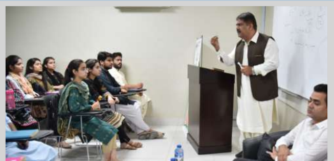
Student Voter Awareness Session in Karachi