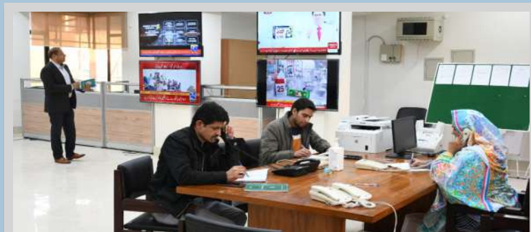
ECP officers monitoring the election process in Monitoring Room at ECP Secretariat.

ECP remained fully active from October to December 2022 to monitor and take actions against the violations in elections. DMOs and Monitoring Teams were deputed and they carried out their duties as per Section 234. They strictly monitored all contesting candidates in subject Elections. Pre-Poll, Poll Day and Post Poll electoral activities were monitored accordingly. Fines imposed, Warnings were served to all violators across the board, who tried to violate Code of Conduct.