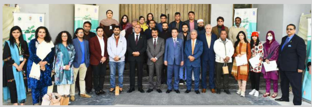
Group Photo of the Commission with winners of "National Youth Painting Competition" and media on National Voters' Day 7 th December, 2022 at ECP Secretariat, Islamabad.