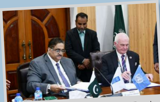
MOU signing ceremony between ECP and UNDP

coordination mechanism by bringing together development partners, direct beneficiaries and the UN. This approach will enhance efficiency, effectiveness and will contribute in enabling environment for elections, with the long-term outlook of strengthening institutions and fostering ownership.