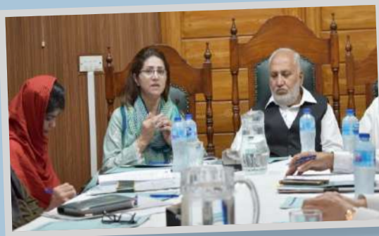
Formation of Provincial Project Coordination Committee (PPCC) in provinces