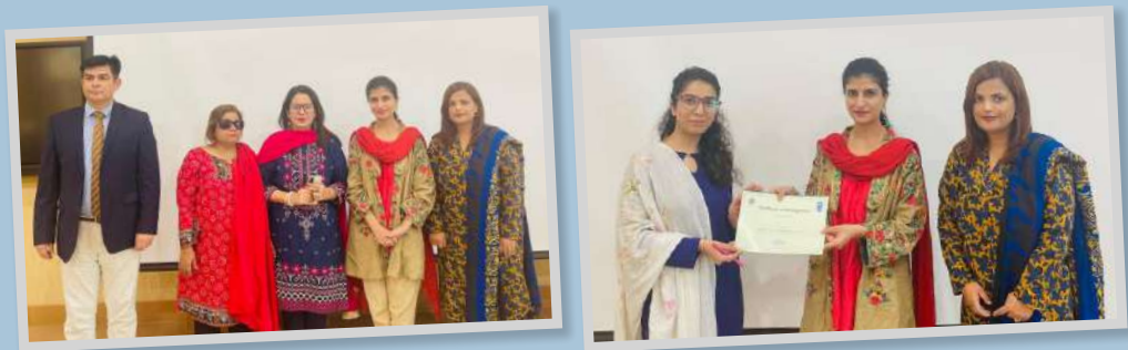
ECP Officers conducting Students Voter Awareness Session at Fatima Jinnah Women University Rawalpindi