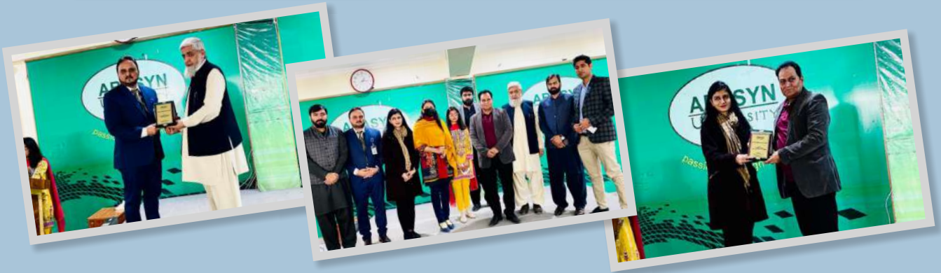
ECP Officers conducting Students Voter Awareness Session at Abasyn University in Islamabad