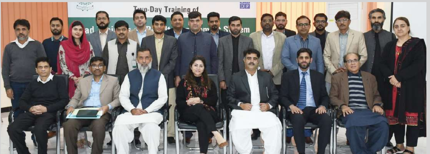
Two days training of Lead Trainers on Result Management System (RMS) at PEADRM in ECP Secretariat- Islamabad.