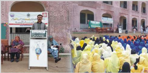
Student Voter Awareness Session in Gujranwala