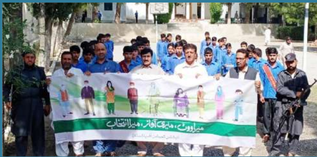
Student Voter Awareness Session in District Orakzai