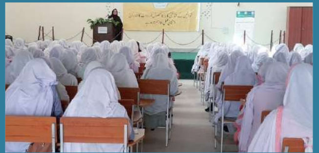
Student Voter Awareness Session in District Charsada