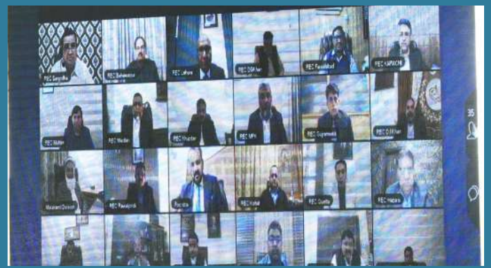
The launch of High-Speed Fiber Optics, connecting all Regional Offices of ECP on National Voters' Day 7 th December, 2022 at ECP Secretariat, Islamabad.