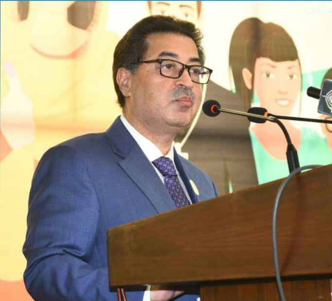
Hon'ble Chief Election Commissioner Mr. Sikandar Sultan Raja addressing the participants on National Voters' Day 7 th December, 2022 at ECP Secretariat, Islamabad.

N ational Voters' Day is celebrated every year on 7 th December to commemorate the first elected Parliament of Pakistan in 1970 on the basis of One Person–One Vote .