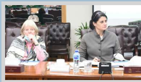
Meeting with Donors and Development Partners