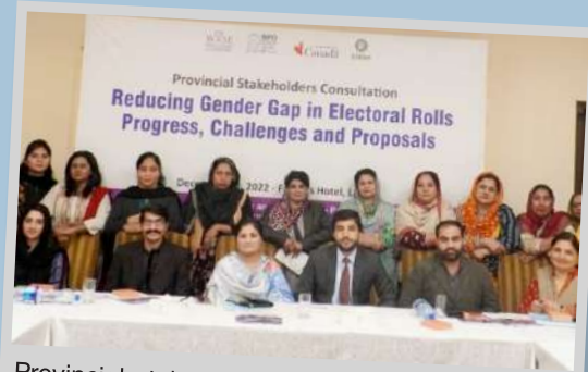
Provincial stakeholders consultation meeting in Lahore to reduce Gender Gap in Electoral Rolls