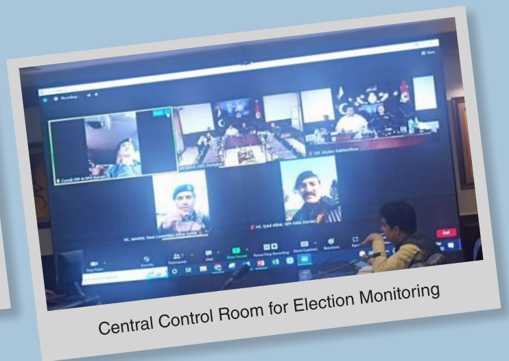
Central Control Room for Election Monitoring