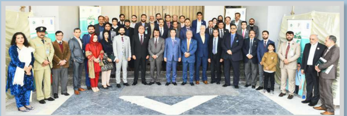
Group Photo of the Commission with officers of ECP on National Voters' Day 7 th December, 2022 at ECP Secretariat, Islamabad.