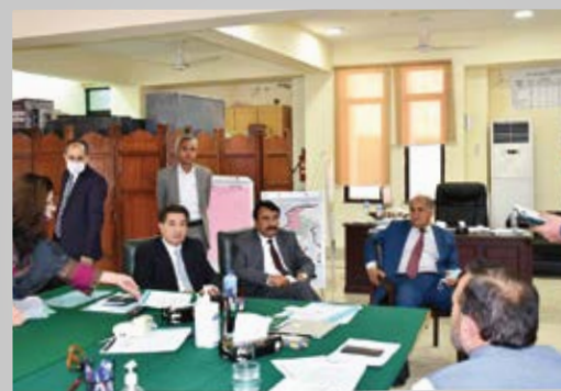
HONOURABLE COMMISSION MONITORING THE ELECTION AT THE CONTROL ROOM ESTABLISHED AT ECP SECRETARIAT.