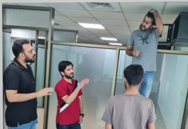
ARRANGMENTS UNDER PROCESS FOR SHIFTING OF SOME WINGS OF ECP AT KOHSAR BLOCK