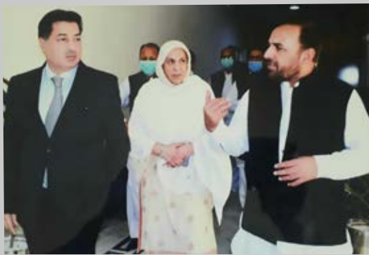
CHIEF ELECTION COMMISSIONER SIKANDAR SULTAN RAJA ON HIS VISIT TO PROVINCIAL OFFICE OF ECP IN KHYBER PAKHTUNKHWA