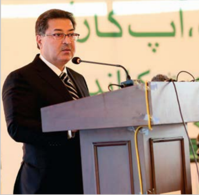
Sikandar Sultan Raja Hon'ble Chief Election Commissioner of Pakistan