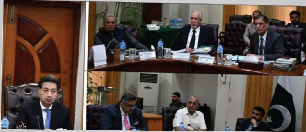
CHIEF ELECTION COMMISSIONER OF PAKISTAN SIKANDAR SULTAN RAJA CHAIRING THE WEEKLY MEETING OF ELECTION COMMISSION OF PAKISTAN