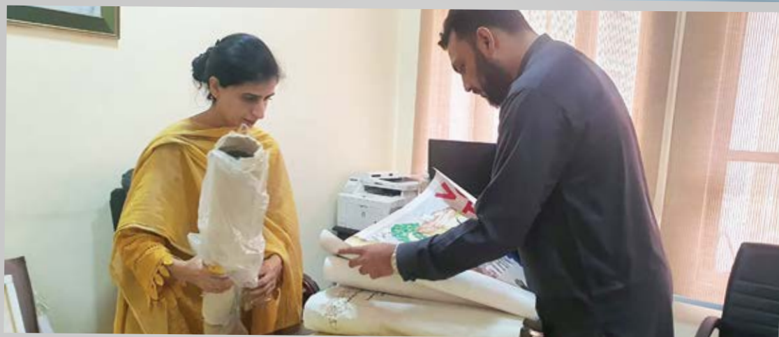
PREPARATIONS TO CONDUCT FIRST EVER PAINTING COMPETITION OF ECP ON THE THEME "YOUR VOTE: TO A PROMISING FUTURE" AMONG STUDENTS