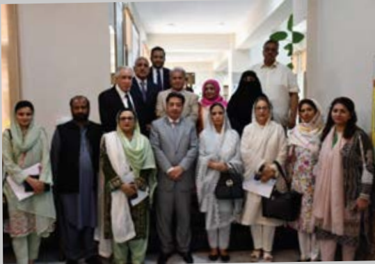
GROUP PHOTO OF CHIEF ELECTION COMMISSIONER OF PAKISTAN SIKANDAR SULTAN RAJA WITH WOMEN PARLIMENTRIANS AT ECP