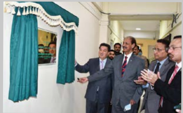
CHIEF ELECTION COMMISSIONER OF PAKISTAN SIKANDAR SULTAN RAJA AND AUDITOR GENERAL OF PAKISTAN AJMAL GONDAL INAUGURATING THE SUBORDINATE CELL OF AGPR AT SECRETARIAT OF ECP