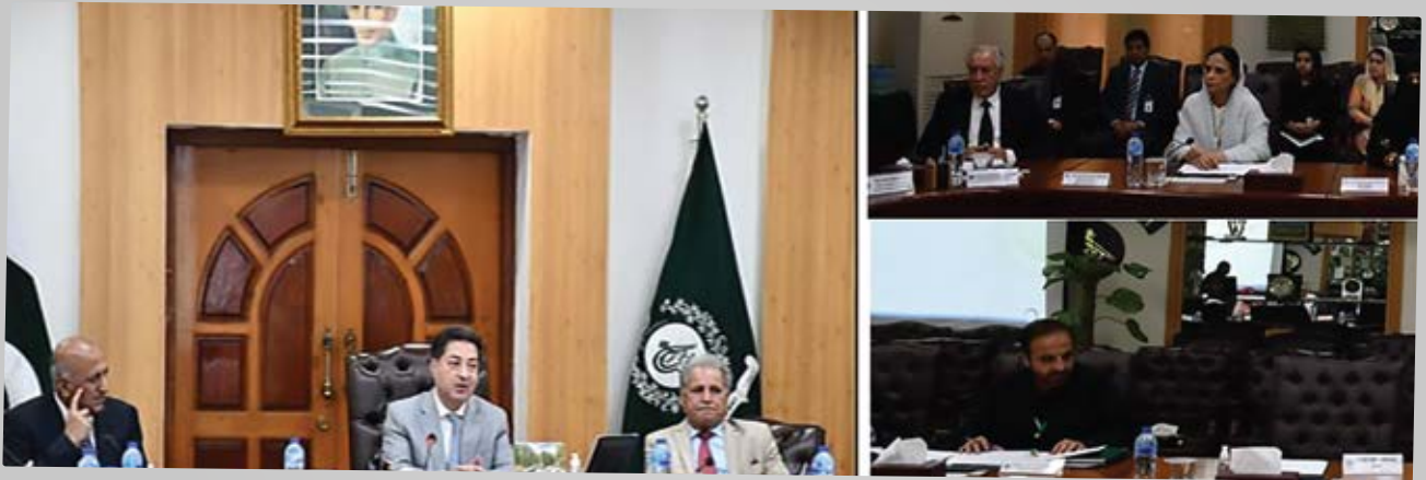
CHIEF ELECTION COMMISSIONER OF PAKISTAN SIKANDAR SULTAN RAJA CHAIRING A MEETING WITH WOMAN PARLIMENTRIAN TO INCREASE WOMEN PARTICIPATION IN ELECTROAL PROCESS